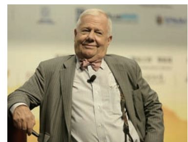
Jim Rogers , Investment Expert and Author Delivered Keynote at China Gold 2016