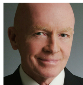
Guest Keynote Speaker: Mark Mobius Ph.D. Emerging markets fund manager and founder of Mobius Capital Partners