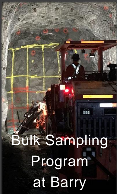
Bulk Sampling Program at Barry