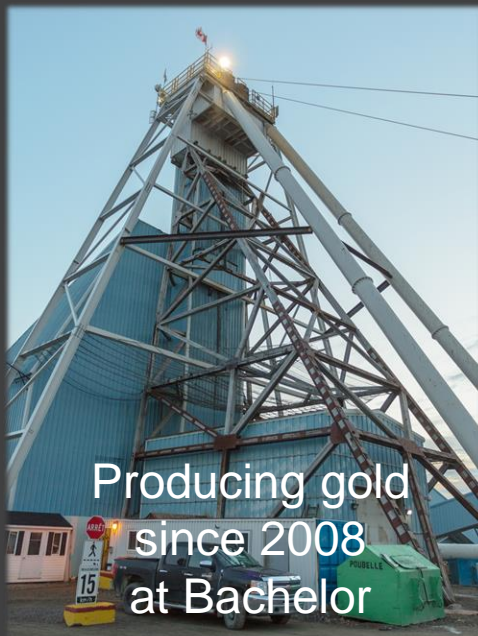
Producing gold since 2008 at Bachelor