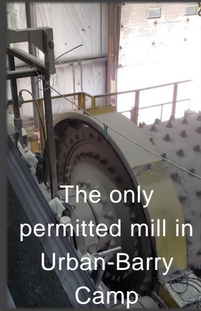
The only permitted mill in Urban-Barry Camp